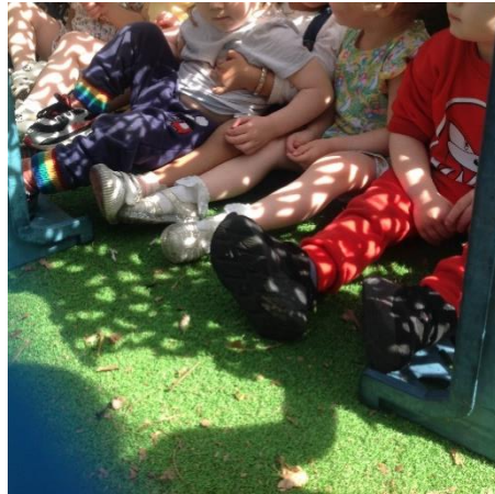
Look how many squeezed inside!